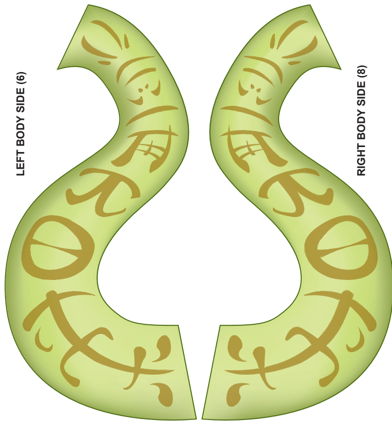
LEFT BODY SIDE (6)